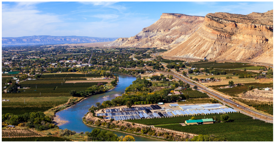
View of Mt. Garfield & Colorado River from Palisade