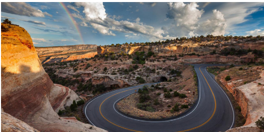
Colorado National Monument